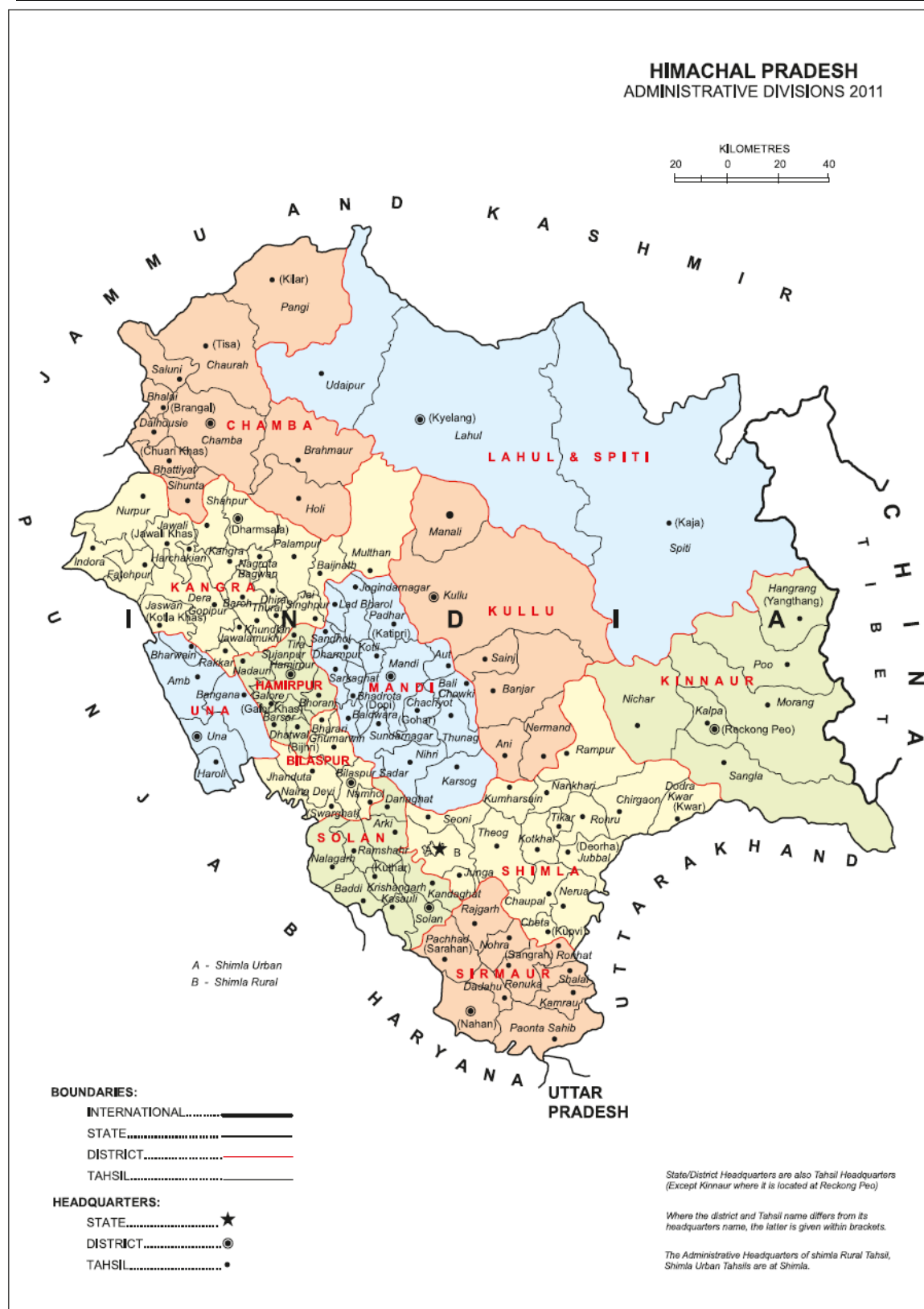
Figure 1: Administrative Divisions and Boundaries of Himachal Pradesh